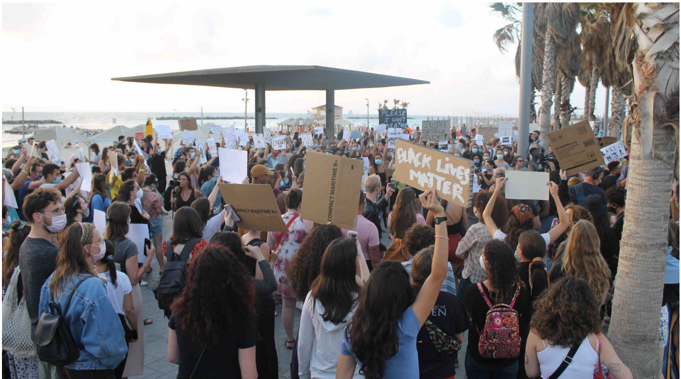
Hundreds showed up to the protest outside the former American embassy in Tel Aviv, June 2, 2020.

teenager shot by an off-duty police officer last year.